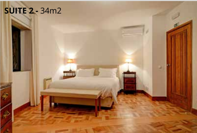
SUITE 2 - 34m2