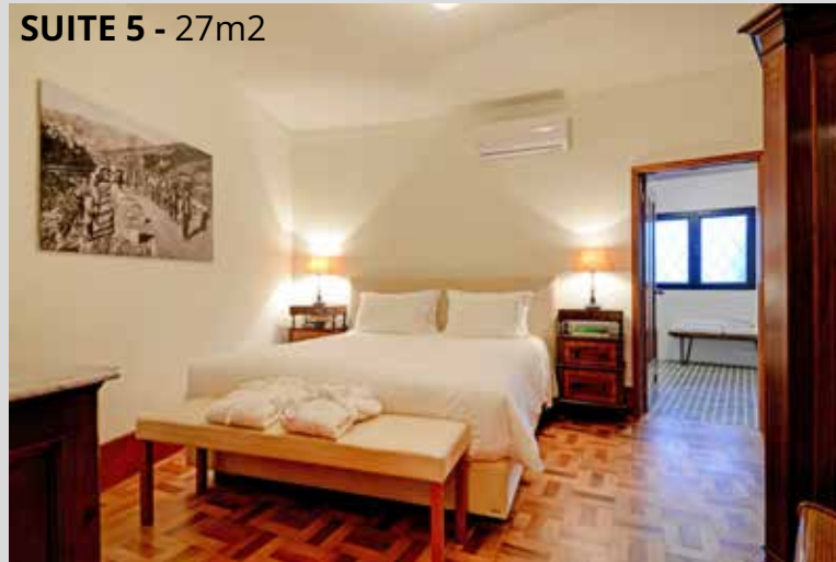
SUITE 5 - 27m 2