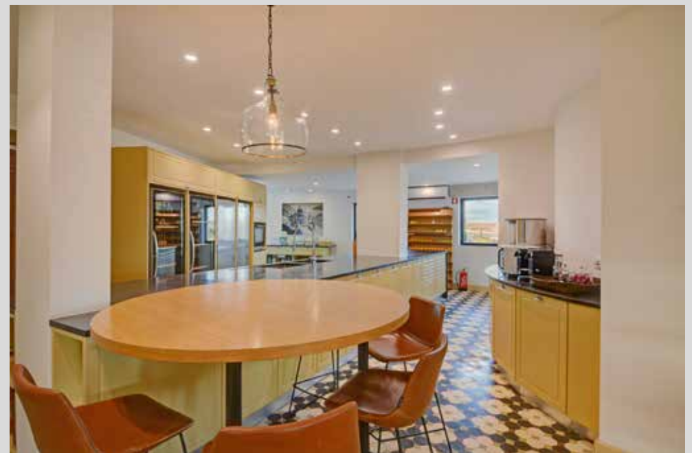
Open plan kitchen