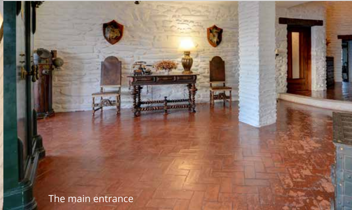
The main entrance