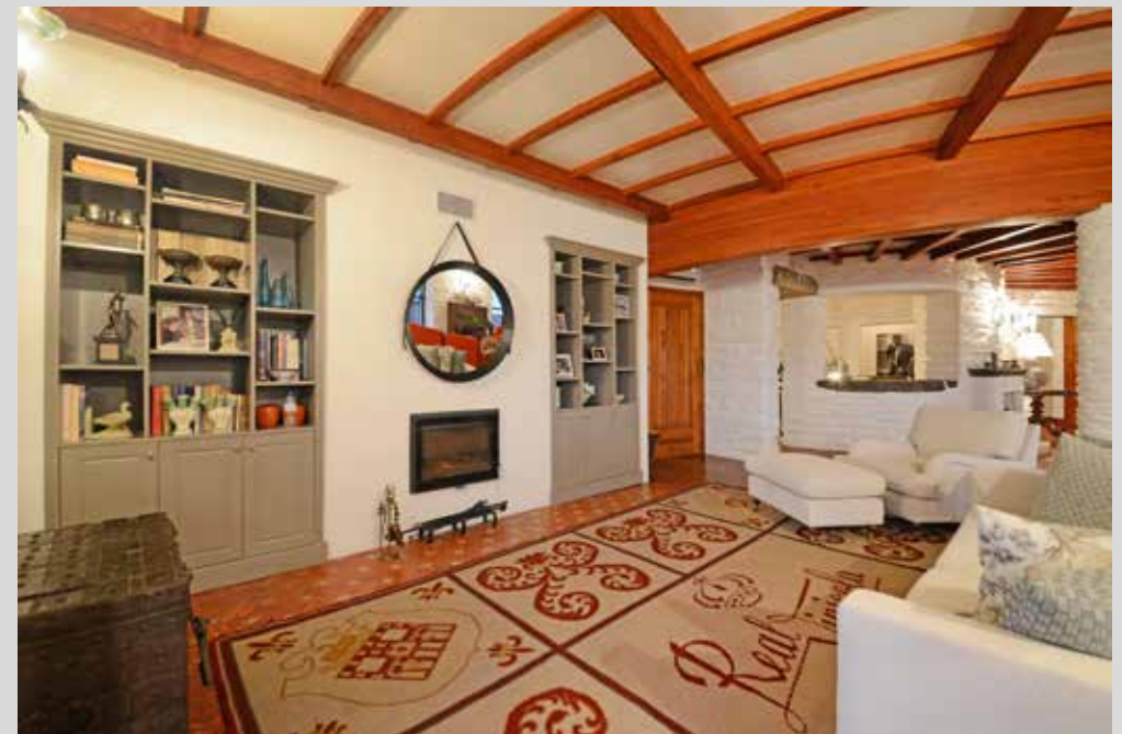
The first floor consists of a large living room also with a fireplace which provides several settings and a corridor leading to the remaining 3 suites.