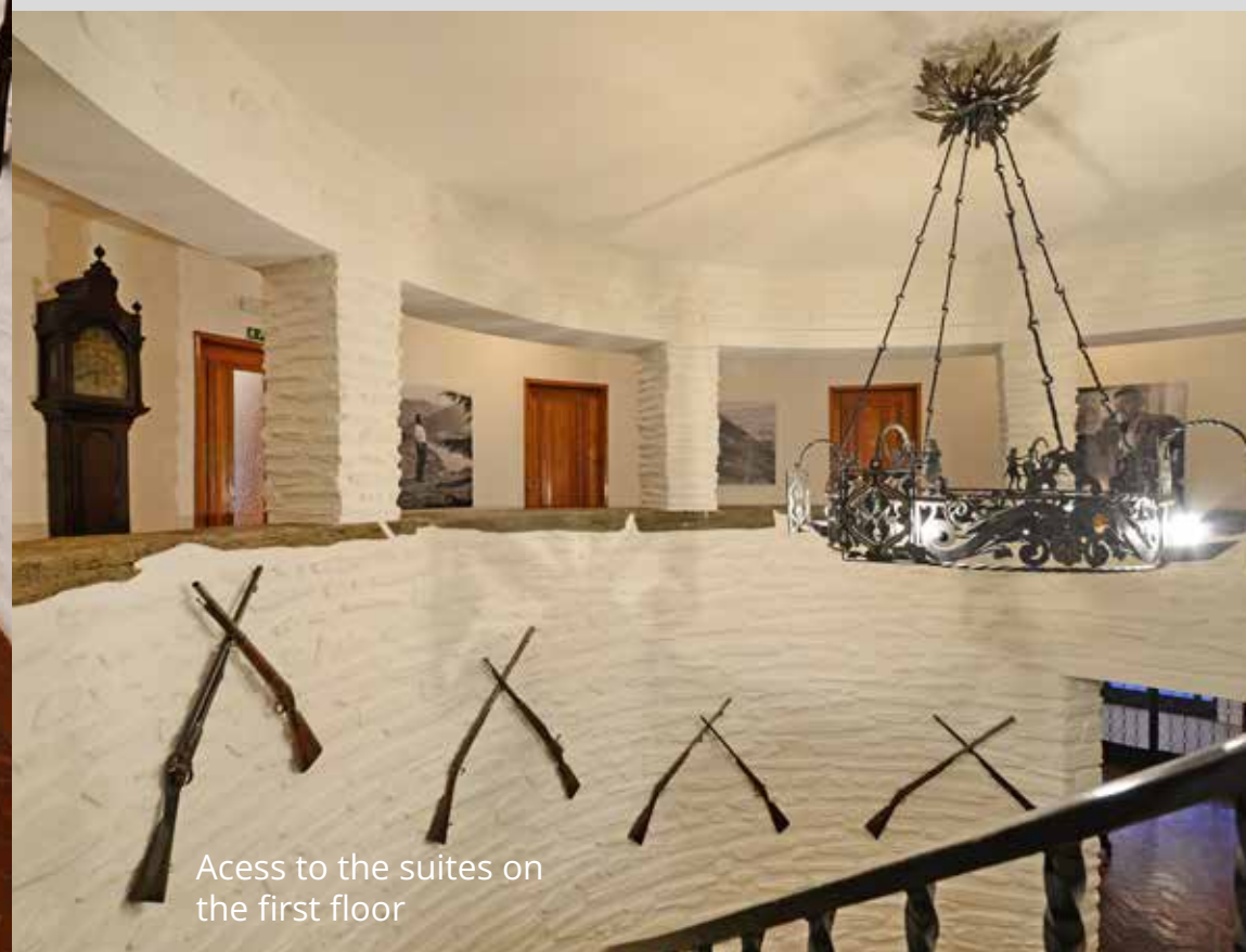
Access to the suites on the first floor