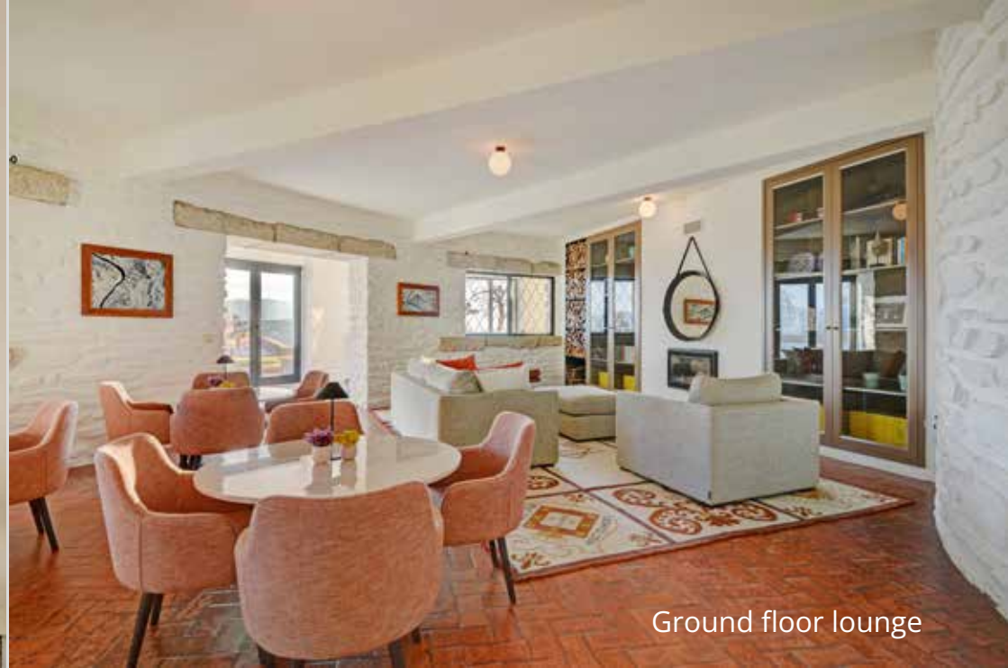
Ground floor lounge