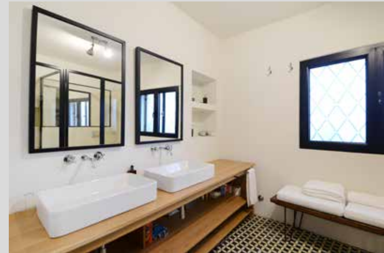
SUITE 6 - 24m 2